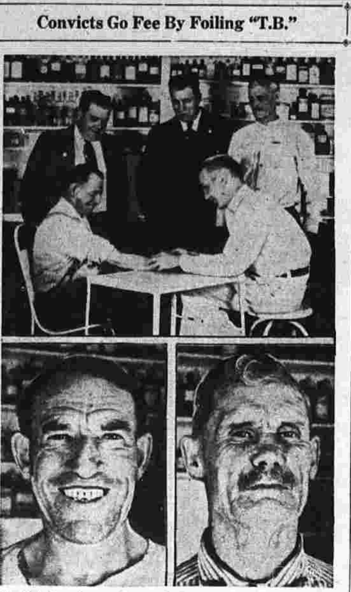
Convicts Go Free by Folling "T.B." Stating their lives in a perilous medical experiment for hope of liberty, two Colorado life-term convicts have won and will be freed from prison before Christmas by order of Governor E. C. Johnson.

TREASURY BALANCE Washington, Dec. 18.—(AP)—The position of the Treasury December 15 was: receipts, $1,063,022,843.94; expenditures, $1,060,915,965.62; balance, $2,106,857,878.32.